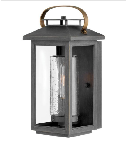
1160AH SMALL WALL MOUNT LANTERN 6.5" W, 14" H Socketed 1-10w Med. LED, 100w Equiv.