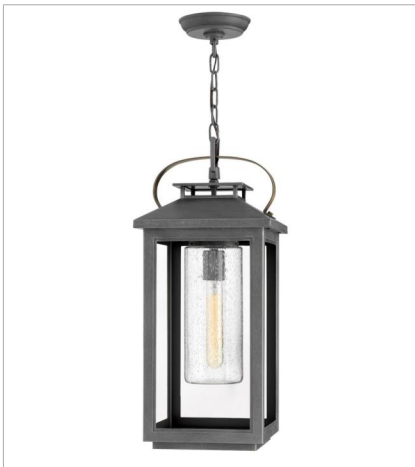
1162AH-LL LARGE HANGING LANTERN 9.5" W, 21.5" H Socketed 1-2w Med. LED *Included