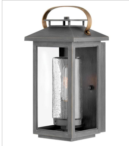
1160AH-LL MEDIUM WALL MOUNT LANTERN 6.5" W, 14" H Socketed 1-2w Med. LED *Included