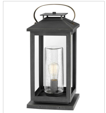
1167AH MEDIUM PIER MOUNT 9.5" W, 21.5" H Socketed 1-10w Med. LED, 100w Equiv.