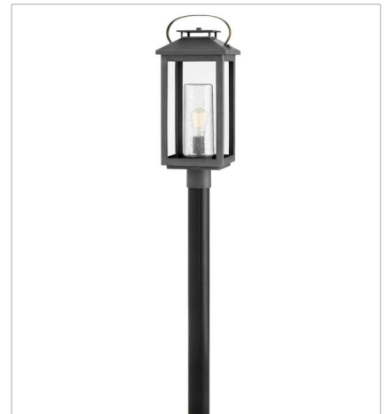
1161AH MEDIUM POST OR PIER MOUNT L... 9.5" W, 23" H Socketed 1-10w Med. LED, 100w Equiv.