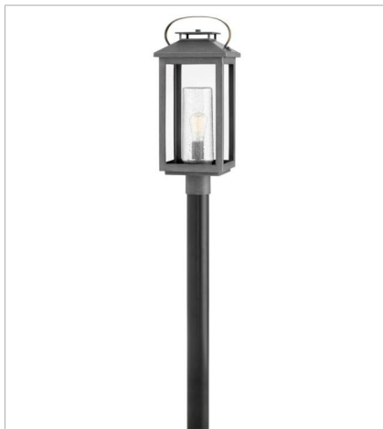
1161AH-LL LARGE POST MOUNT LANTERN 9.5" W, 23" H Socketed 1-2w Med. LED *Included