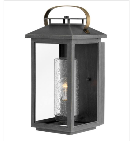
1164AH MEDIUM WALL MOUNT LANTERN 8.3" W, 17.5" H Socketed 1-10w Med. LED, 100w Equiv.