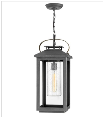
1162AH-LV LARGE HANGING LANTERN 12V 9.5" W, 21.5" H Socketed 1-3.50w Med. LED *Included