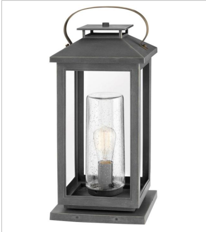
1167AH-LL LARGE PIER MOUNT LANTERN 9.5" W, 21.5" H Socketed 1-2w Med. LED *Included