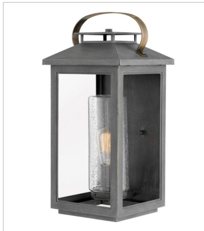
1165AH-LL MEDIUM WALL MOUNT LANTERN 9.5" W, 20.5" H Socketed 1-2w Med. LED *Included