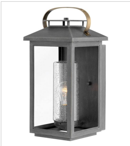
1164AH-LL MEDIUM WALL MOUNT LANTERN 8.3" W, 17.5" H Socketed 1-2w Med. LED *Included