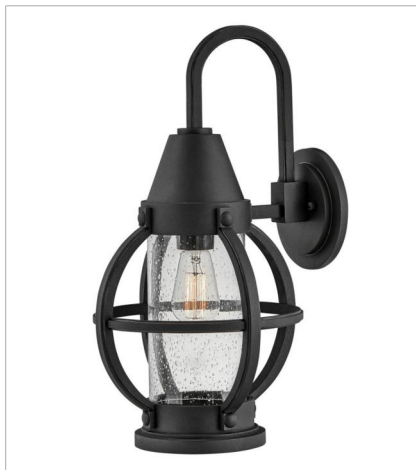
21005MB MEDIUM WALL MOUNT LANTERN 10.5" W, 20" H Socketed 1-10w Med. LED, 60w Equiv.