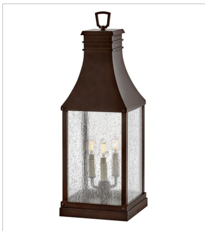
17467BLC LARGE PIER MOUNT LANTERN 9.5" W, 26.8" H Socketed 3-5w Cand. LED, 60w Equiv.

FINISH: Blackened Copper GLASS: Clear Seedy