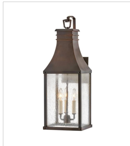
17465BLC LARGE WALL MOUNT LANTERN 9" W, 26.3" H Socketed 3-5w Cand. LED, 60w Equiv.