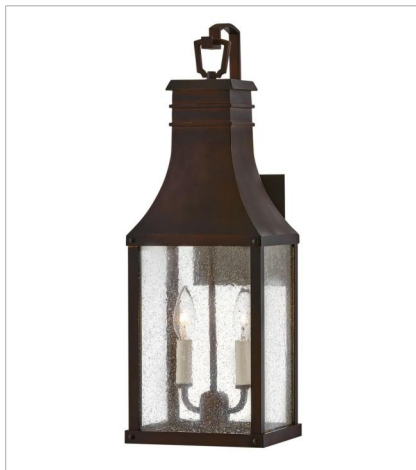
17464BLC LARGE WALL MOUNT LANTERN 7.8" W, 23" H Socketed 2-5w Cand. LED, 60w Equiv.