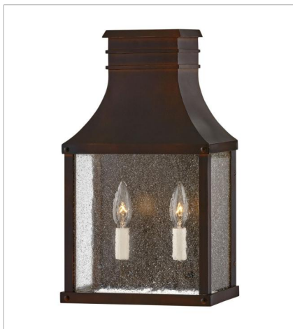
17466BLC MEDIUM WALL MOUNT LANTERN 9.8" W, 17.3" H Socketed 2-5w Cand. LED, 60w Equiv.