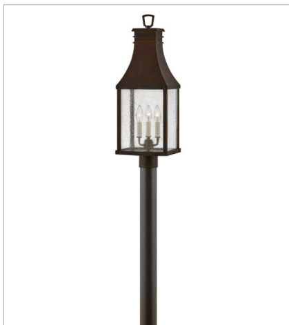
17461BLC LARGE POST MOUNT LANTERN 9" W, 26.3" H Socketed 3-5w Cand. LED, 60w Equiv.