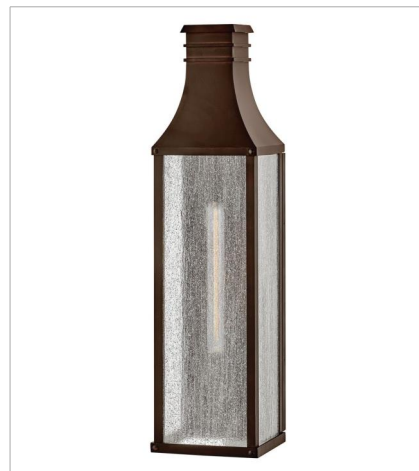
17469BLC-LL LARGE TALL WALL MOUNT LANTERN 8" W, 30" H Socketed 1-4w Med. LED *Included