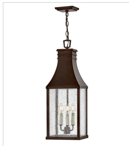
17462BLC LARGE HANGING LANTERN 9" W, 25.5" H Socketed 3-5w Cand. LED, 60w Equiv.