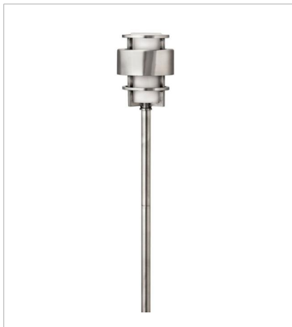
1579SS-LL LED PATH LIGHT 4.5" W, 22.3" H Socketed 1-2.50w T5 LED *Included

FINISH: Stainless Steel GLASS: Etched Opal