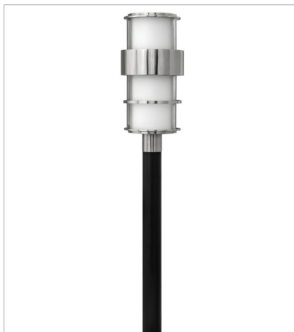
1901SS LARGE POST TOP OR PIER MOUN... 10" W, 21.8" H Socketed 1-12w Med. LED, 100w Equiv.