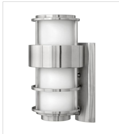
1904SS MEDIUM WALL MOUNT LANTERN 8" W, 16" H Socketed 1-12w Med. LED, 75w Equiv.