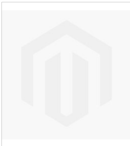
1905SS LARGE WALL MOUNT LANTERN 10" W, 20.3" H Socketed 1-12w Med. LED, 100w Equiv.