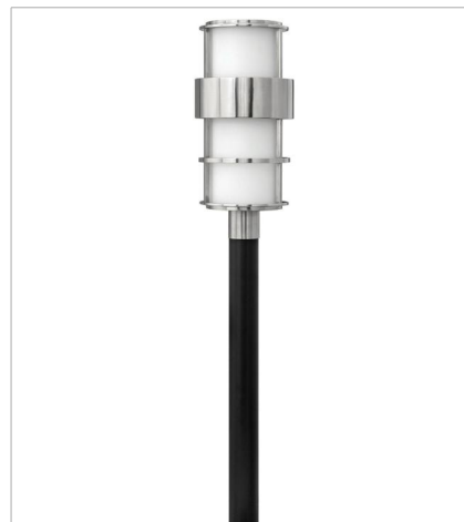
1901SS-LV LARGE POST MOUNT LANTERN 12V 10" W, 21.8" H Socketed 1-3.50w Med. LED *Included