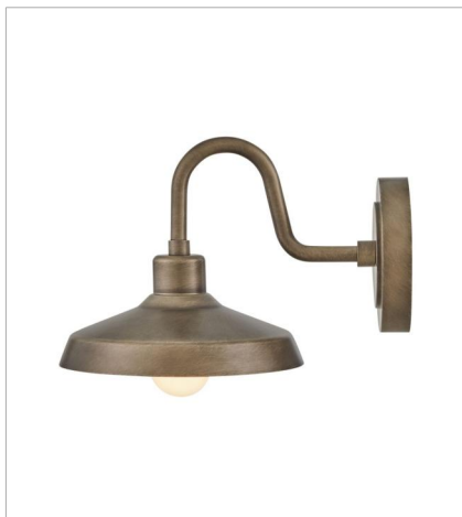
12076BU SMALL WALL MOUNT BARN LIGHT 9.5" W, 9" H Socketed 1-14w Med. LED, 100w Equiv.