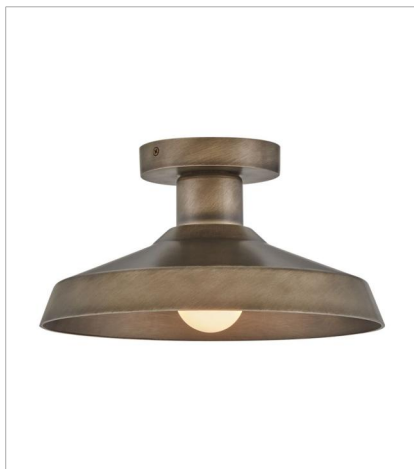
12072BU SMALL FLUSH MOUNT 12" W, 6.5" H Socketed 1-12w Med. LED, 100w Equiv.