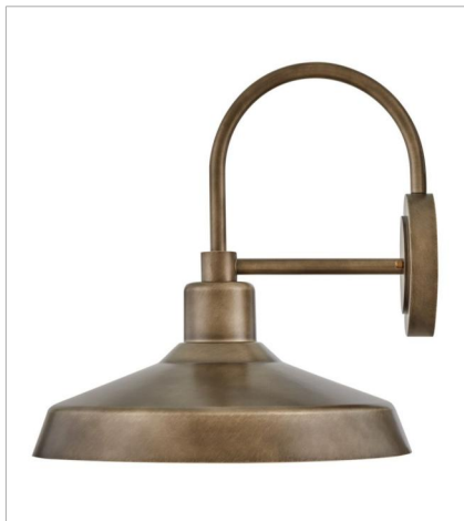
12070BU MEDIUM WALL MOUNT BARN LIGHT 16" W, 16.5" H Socketed 1-14w Med. LED, 100w Equiv.

FINISH: Burnished Bronze SHADE: Composite