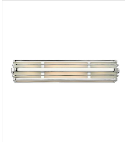
5234CM FOUR LIGHT VANITY 26.3" W, 5" H Socketed 4-14w Med. LED, 100w Equiv.