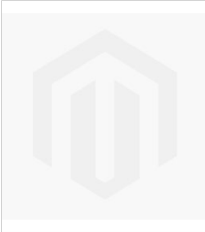
5232CM TWO LIGHT VANITY 15.5" W, 5" H Socketed 2-14w Med. LED, 100w Equiv.